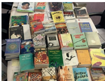
The 148 submissions for the 2017 Caine Prize for African Writing.