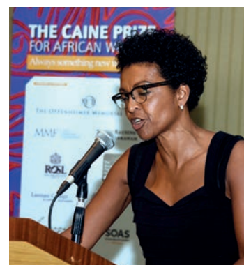
Acclaimed film, television and voice actor, Adjoa Andoh, reads extracts from the shortlisted stories at the award dinner in London.