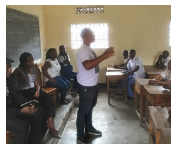
Participants at the Caine Prize workshop talking to students at a school near Bagamoyo.