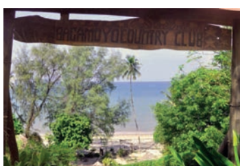
The Caine Prize workshop was hosted by the Bagamoyo Country Club, Tanzania.