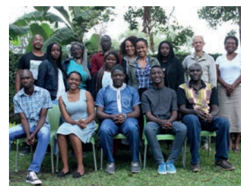
The 2017 Caine Prize Writers' Workshop in Bagamoyo, Tanzania.