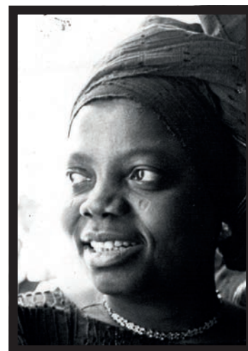
Buchi Emecheta.