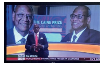
BBC World News report on the Caine Prize for African Writing.

In a first for the Caine Prize, we also live-streamed the event through Periscope, broadcast through our social media. The feed was watched by audiences in Africa and around the world, increasing access to the announcement for international fans of the Prize who would otherwise be unable to attend.